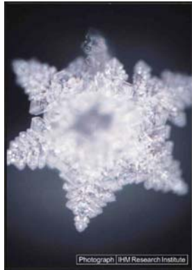
Picture 7. crystal of water that was shown five religions' names

Many questions could be asked of this 'experiment'. For instance, does the water crystal form in response to the purity or consciousness of each religion, and is it affected by the way in which it is interpreted and used in society?